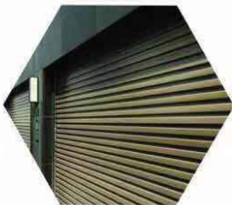
Galvanized Steel(Taiwan) Thickness -0.5mm Color -(02)Cream (05)Grey,(04)palm