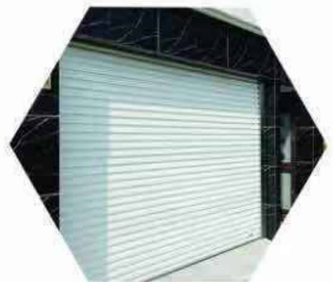
Galvanized Steel (Korea) Thickness -0.4mm Color -White, Cream,Green