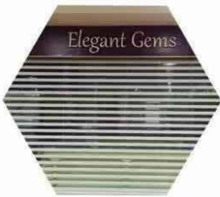
Aluminium PC(Taiwan) PC Slats : 3mm thk

Get Professional Consultants to help you NOW!