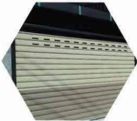
Aluminium Grille(Taiwan) Thickness -1.5mm Color -(04)Jasper, (07)Paperback