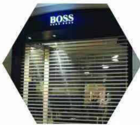
Aluminium Crystal(Taiwan) Thickness -Crystal(1.7mm) Color -(01)White