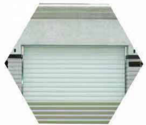
Aluminium Shutter(Taiwan) Thickness -1.5mm Color -(04)Jasper,(07)Paperback